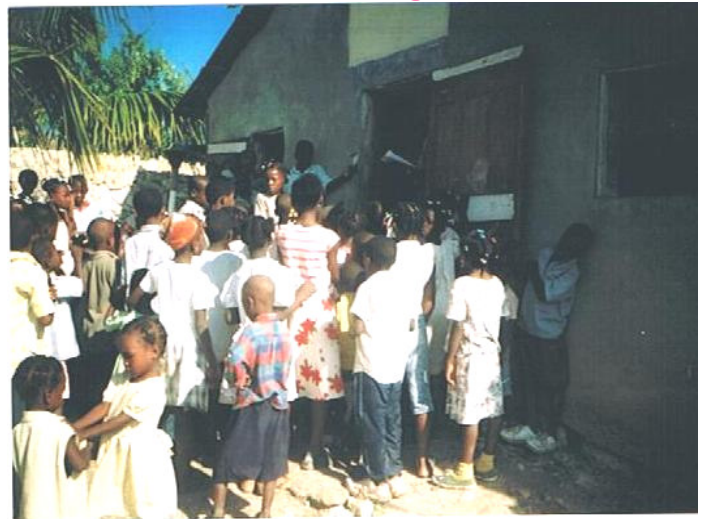
These Haitian children are waiting for your special love

All Love Parcels should be in our warehouse on or prior to November 1, 2007 for shipment to the mission field.